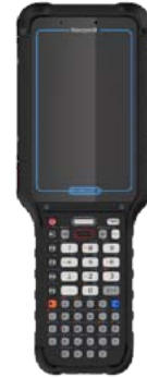
Fig 1: CK67 Ultra-rugged 5G mobile computer on the Mobility Edge™ platform

The CK67 is designed to endure the most challenging environments in warehouses and DCs. Warehouses are as busy as ever and operators need to keep their workflows running efficiently with maximum uptime. Users in warehouses can rely on the CK67, withstanding up to 8ft drops across operating temperatures and 4,000 1.0m tumbles. Users can be confident with the intense durability testing the CK67 undergoes before release, that it will solidify and keep operations and is the ultimate long-term investment.